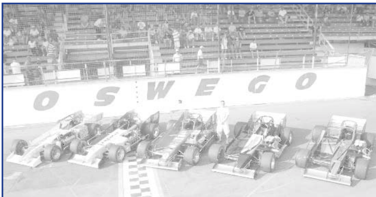
The Oswego Speedway has been a continuously run weekly racetrack since it opened in August of 1951.

It's mentioned in racing circles that the Oswego Speedway is the "Indy of the East." No fewer than a dozen of its past and present competitors have