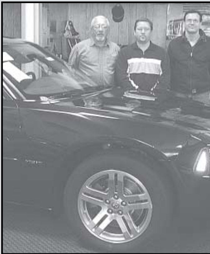
Since 1947, the Longley Family has committed themselves to customer service. The mission statement of Longley Dodge and now Longley Auto Sales is dedicated to you. Visit them at longleydodge.com.