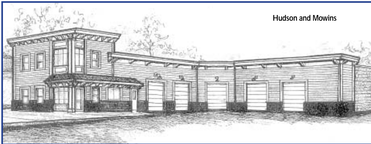
Hudson and Mowins

If you recently purchased a new vehicle, you can choose where to have warranty work done. You can maintain your new vehicle warranty at Hudson and Mowins. According to the Magnuson-Moss Act, your vehicle manufacturer's